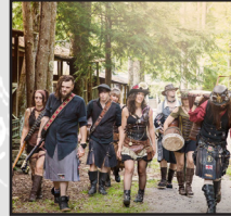
TUATHA DEA BAND PERFORMERS GNOPPD 2014 GATLINBURG, TN