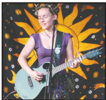
SJ TUCKER MUSICIAN PERFORMER GNOPPD 2015 DUMAS, AR