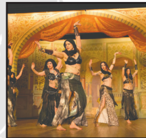
TRYBE HABIBI BIZARRE BELLY DANCERS PERFORMERS GNOPPD 2013 LAFAYETTE, LA